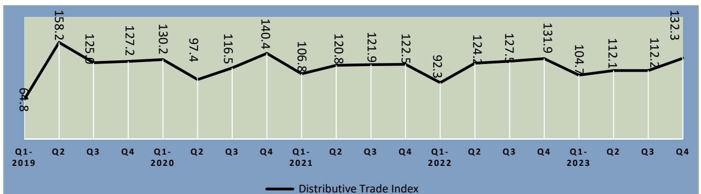
Figure 1: Distributive Trade Index, 1 st quarter 2019 to 4 th quarter 2023

(Figure 2) . A quarter-on-quarter comparison reflected a 17.9 percentage (Figure 3) , increase in the index when compared to 112.2 in 3 rd quarter 2023 (Figure 1) .